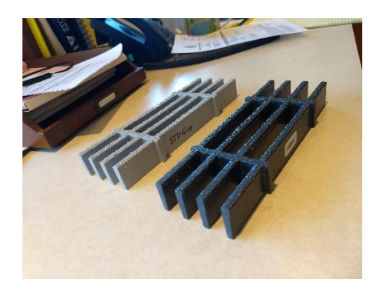
Fiberglass Grated and Gritted Float Surface