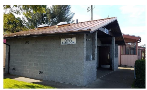
Exterior of Port's Public Restrooms

The Port used bond measure funds, as approved by the voters, to upgrade the public bathrooms. The shingle roof was replaced by a metal roof with new skylights, the toilets, urinal, and hand dryers are now operated by motion detectors, new stall doors, lights, and mirrors were installed, the interior walls painted and the exterior walls pressure washed, the soffits painted, and a new floor surface was poured. The stainless steel fixtures were retained but steam cleaned and polished, except for the urinal which was replaced. The public bathrooms are now ready for Port guests to use for many more years to come.